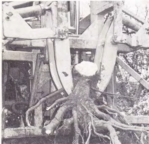
H.S. 50 ROOT CLAW ATTACHMENT An extra attachment for the Hydrastumper 50 which enables the stumps of trees, previously felled at ground level, to be extracted.