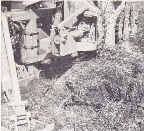
HYDRASTUMPER 50 Suitable for complete clearance or thinning, and removing overgrown hedgerows.