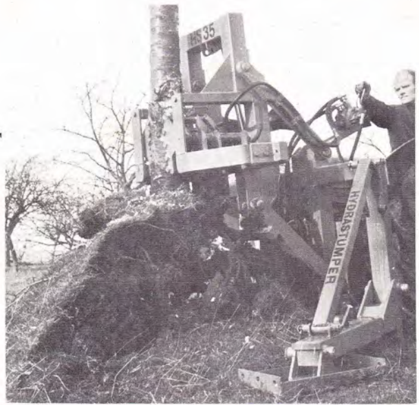
HYDRASTUMPER 35 Suitable for trees up to 88cm (35") girth. Mounted on a 35 h.p. Tractor is ideal for plantation work in many parts of the world.